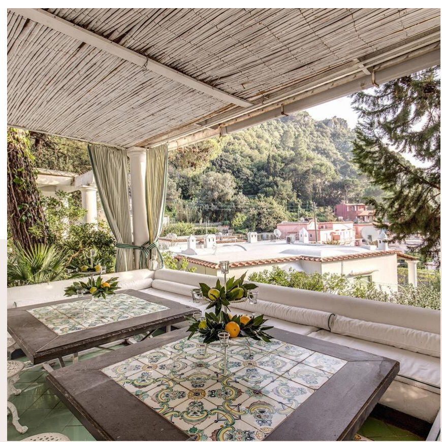
The retreat includes